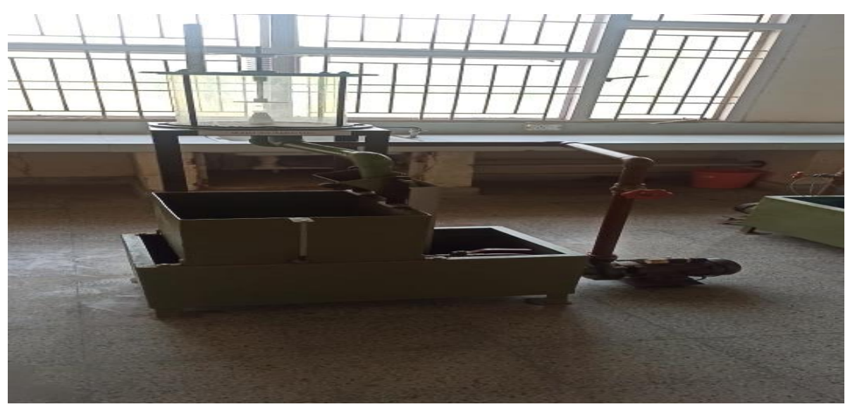
Water Jet Apparatus