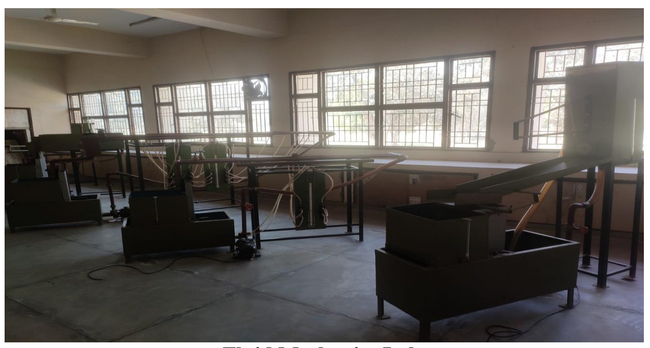
Fluid Mechanics Lab