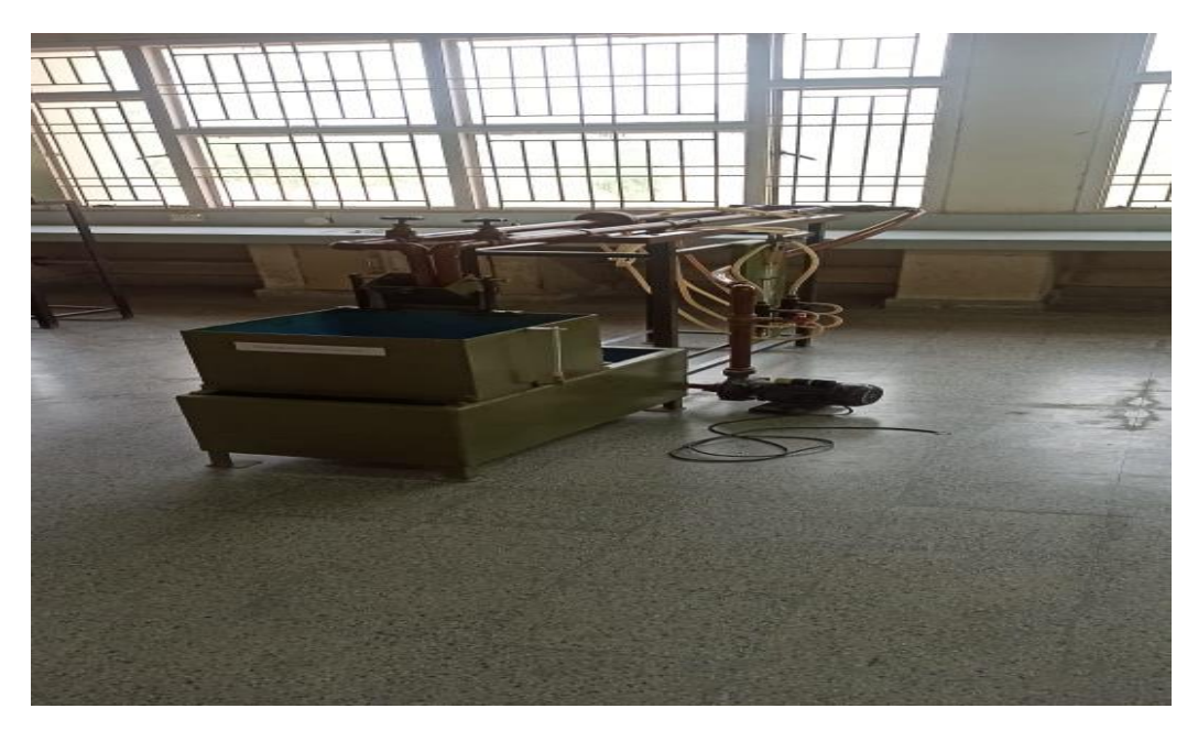
Orificemeter and Venturimeter Apparatus