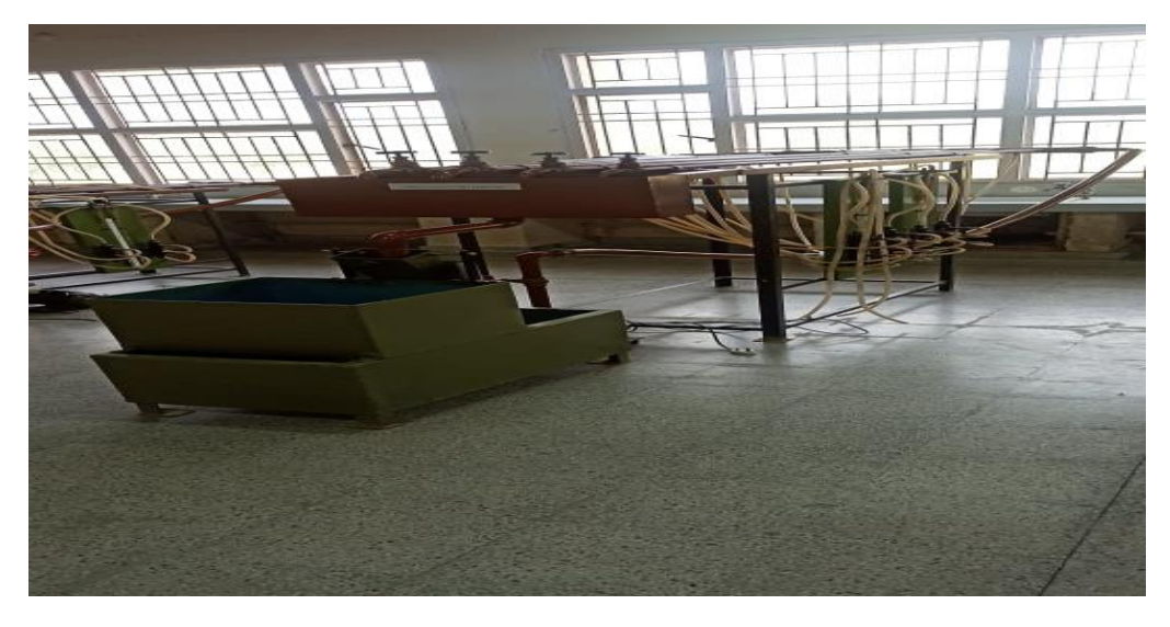
Friction Losses in Pipes Apparatus