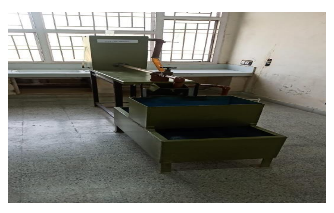
Notch Plate Apparatus