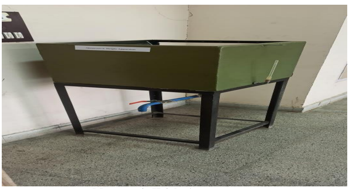
Metacentric Height Apparatus