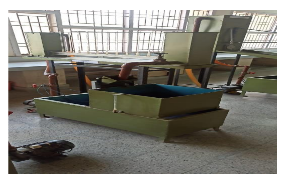
Bernaulli's Theorem Apparatus