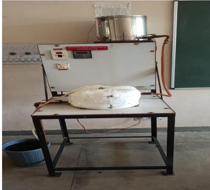
Stefan Boltzmann's Apparatus