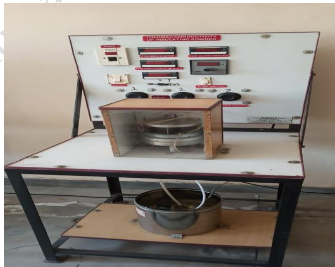
Conductivity of an insulating powder apparatus