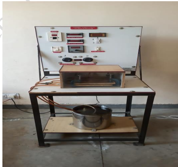
Guarded Hot Plate Apparatus