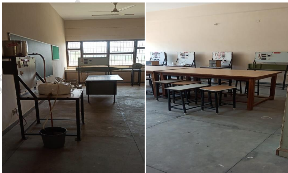
Heat Transfer Lab