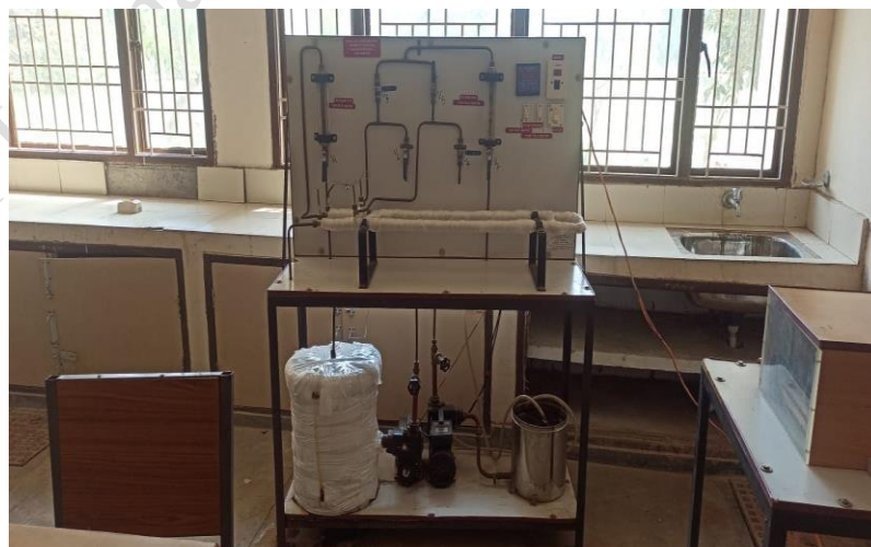
Heat Exchange Apparatus