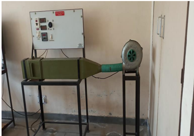
Pin Fin Apparatus