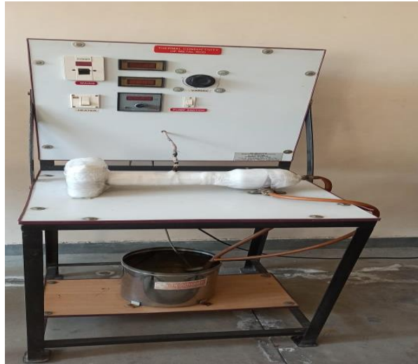
Conductivity of a Metal Rod Apparatus